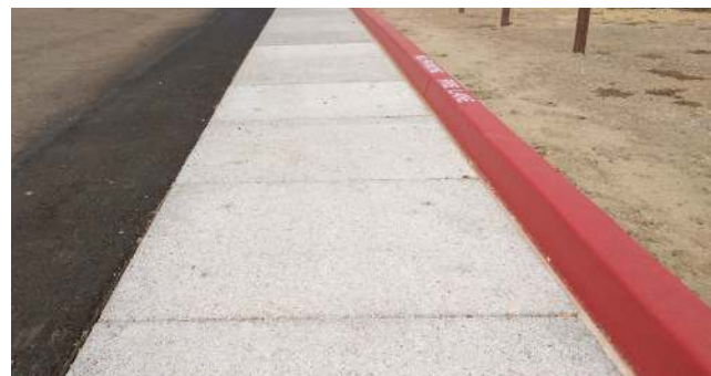
STORMCRETE GUTTER APPLICATION

Have questions? Contact your local Ferguson Stormwater/Geo Specialist or Urban Green Infrastructure BMP Specialist for assistance with your next design.