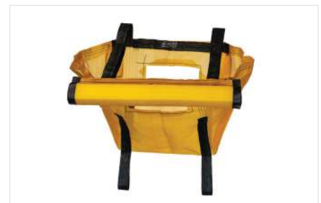
ECONOSACK CURB WITH OVERFLOW

For more information about Inlet Protection, contact Inside Sales at 800.448.3636 or info@ferguson.com or visit us at fergusongss.com