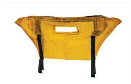
ECONOSACK WITH OVERFLOWS