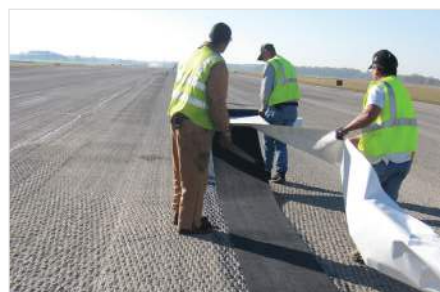
PAVEMENT CRACK REPAIR

For more information about Inlet Protection, contact Inside Sales at 800.448.3636 or infogeo@ferguson.com or visit us at fergusongss.com