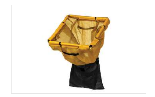
SILTSACK WITH FRAME