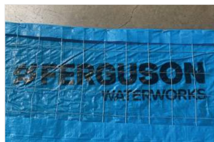
PRINTED SILT FENCE

For more information about Erosion and Sediment Control, contact Inside Sales at 800.448.3636 or infogeo@ferguson.com or visit us at fergusongss.com