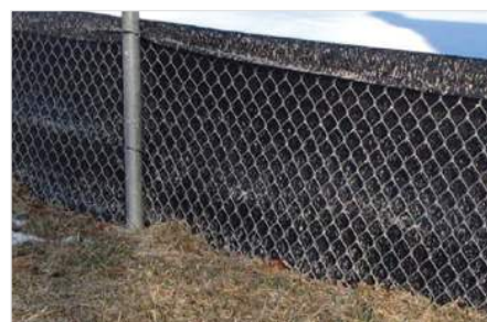
SUPER SILT FENCE POST