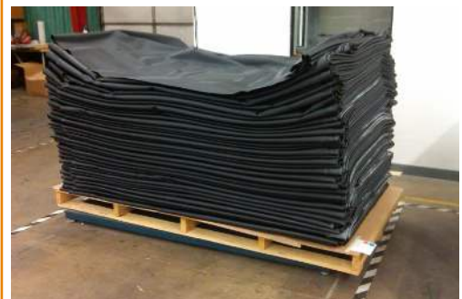
Fabricated Geomembrane on Pallet.

Depending upon the complexity of the project, it might be required to perform the installation of the geomembrane(s) under the direction of a field installation Supervisor who shall be responsible throughout the geomembrane installation, for geomembrane panel layout, field seaming, testing, patching, repairs, and all other activities of the Geomembrane Installer.