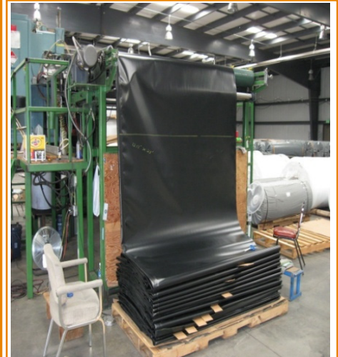
Fabricated Geomembrane Being Folded onto the Pallet.

It is the responsibility of any of the aforementioned parties to select a Geomembrane Installer with the appropriate degree of experience, personnel, and equipment to accomplish the required quality standards.