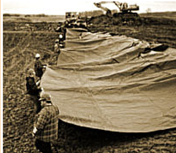
Pulling out a Fabricated Geomembrane Panel