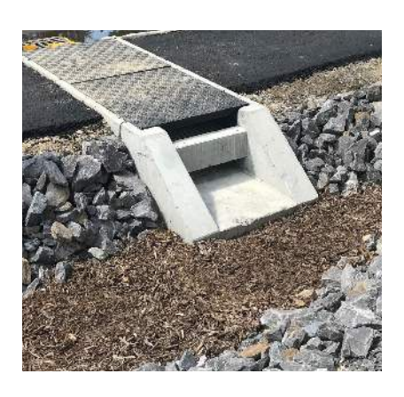
Applications: Commercial - with sidewalk