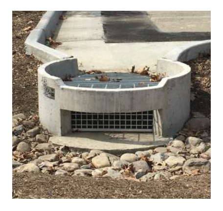
Applications: Commercial - no sidewalk

All functional elements apply to all chambers