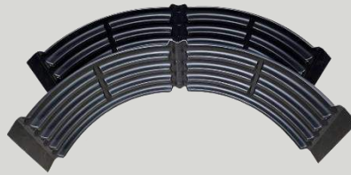
(1) 42” (1050 mm) Split Band Coupler – 2

Before you start please check to make sure all components are on site.