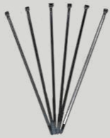
(6) 30” (750 mm) Zip Ties

The components of the 42” (1050 mm) Split Coupler are as follows: